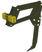
Narrow Straight Leg 3/4" x 4"