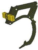
Parabolic Shank 1-1/8" x 3" Edge Bent