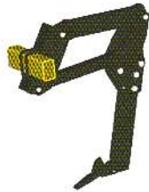
HD Straight Leg 1-1/4" x 4"